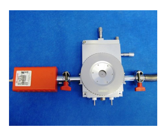
THMS350V with Vacuum Gauge attached.