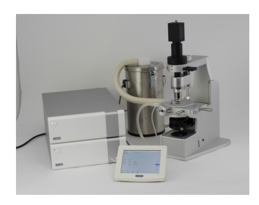
THMS350V system with Cooling option