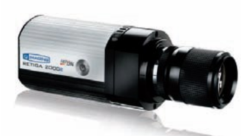
QICAM Fast 1394 non-cooled CCD Colour -Bayer Mosaic, 12-bit camera