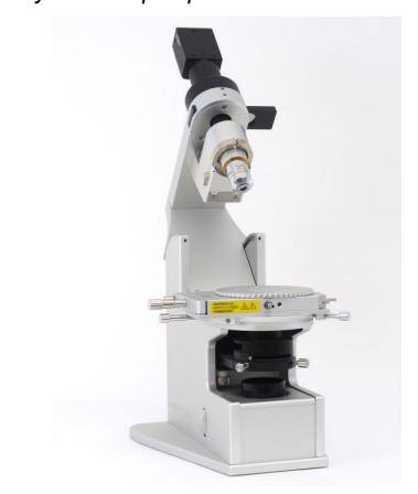
Linkam Imaging Station. Optics are tilted back to allow easy access to sample

Free up time on your research microscope by attaching your THMS350V stage to the Linkam Imaging Station instead. The imaging station has been designed specifically for temperature controlled microscopy. Standard microscope lens can be loaded into the quick lock mounting jaws which can be easily swung back out of the way of the stage to allow greater sample