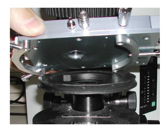
Hotstage similar to THMS350V with stage clamps being attached to circular dovetail substage.

Select the stage clamps you require from the 'Optical Accessories' section on our website.