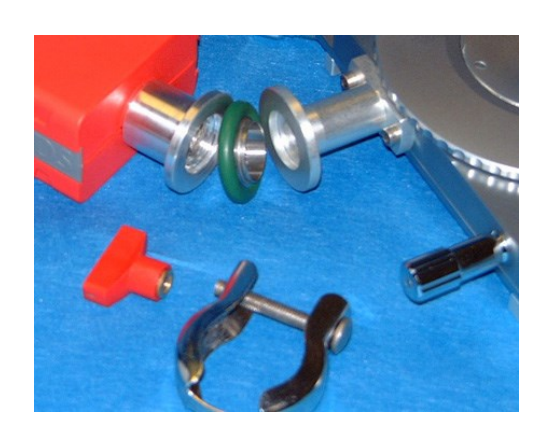
Pirani Vacuum gauge connections with THMS350V stage