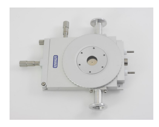
The THMS350V heating and freezing vacuum stage

Please talk to Linkam if you require this option