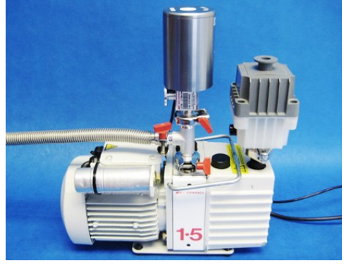
Rotary vacuum pump

A motorized valve receives pressure data via the T95-LinkPad and controls the vacuum pressure inside the sample chamber. You can dial in a specific vacuum value as part of a temperature profile and the valve will automatically control the pressure. You will need a 2.5 m³/h rotary vacuum pump for this valve to function optimally. (Including with the Pro system).