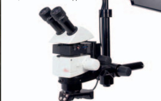
Leica S series with LED1000 HiPower spotlight combi controller and focusing arm.